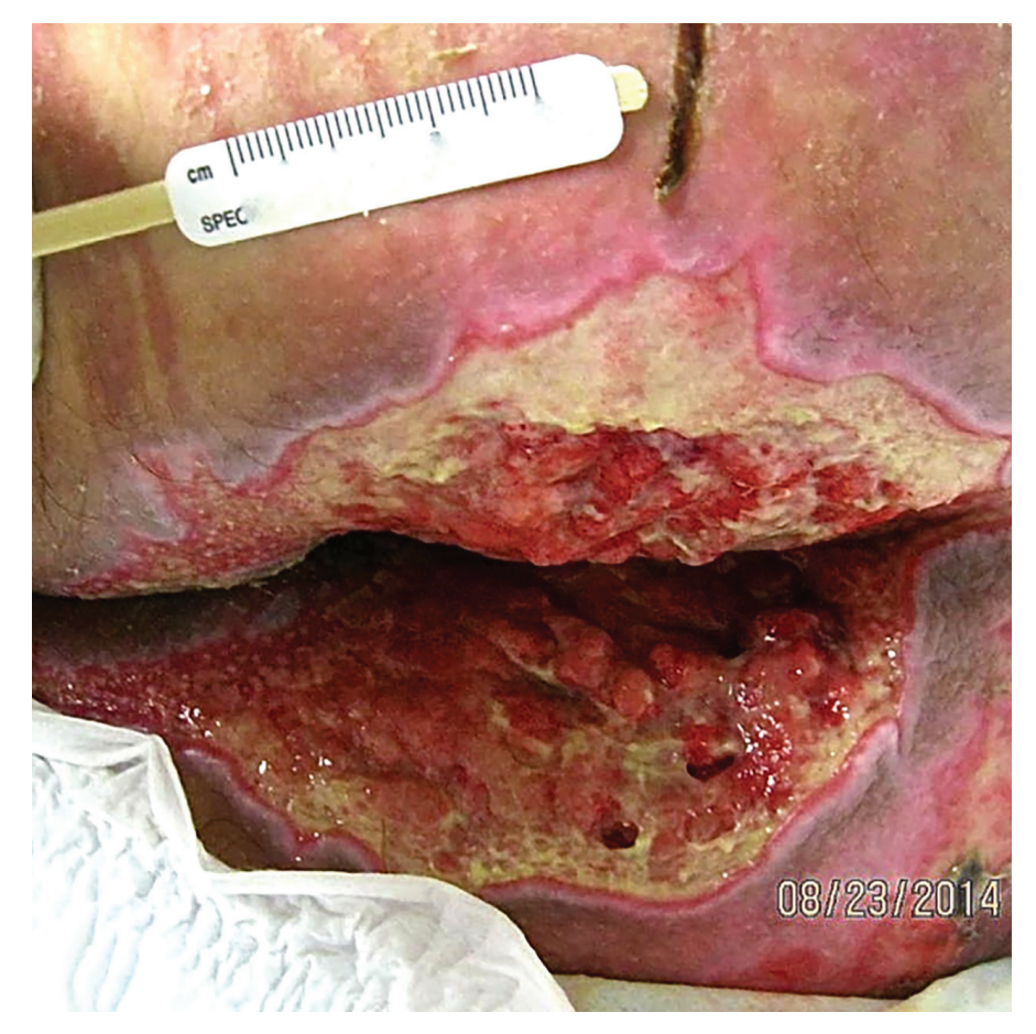
8/23/14 (WEEK 1)

Disposable undergarments were not used to preclude contamination of the wound with excrement. Additionally, advanced wound healing modalities, cellular and/or tissue-based products, antimicrobial or collagen dressings were not utilized in the episodes of care for this patient.