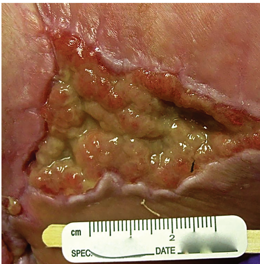
8/2/14 (WEEK 1)

the wound bed. The wounds were dressed with sterile gauze moistened with Puracyn Plus. The patient was seen in the wound clinic twice per week for the wound care procedure as stated above. The patient was discharged on 9/16/14.