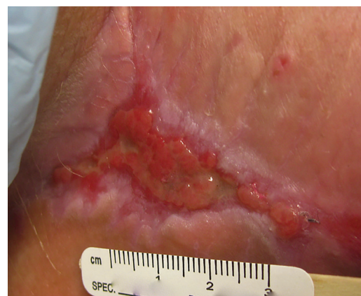
8/16/14 (WEEK 2)